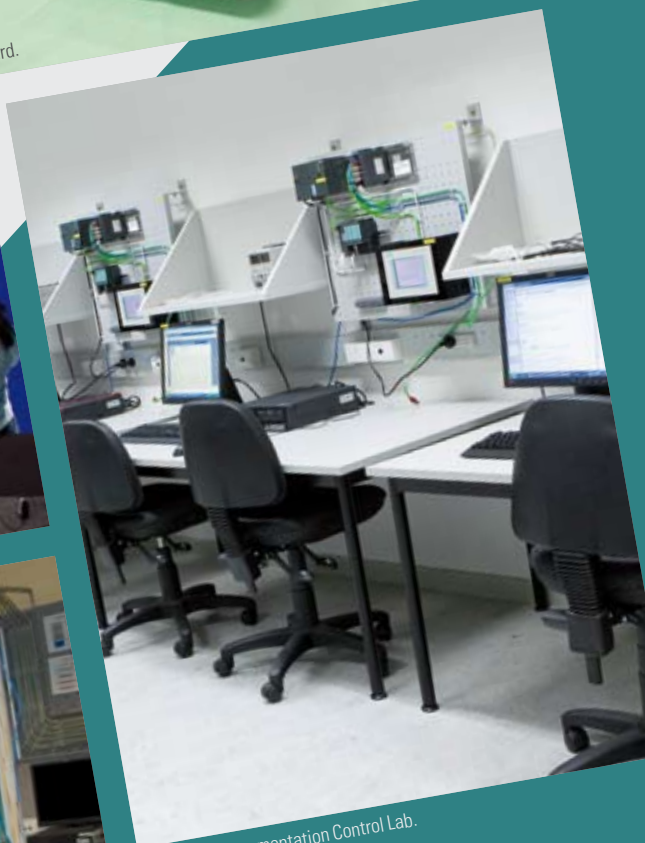
SIEMENS Instrumentation Control Lab.