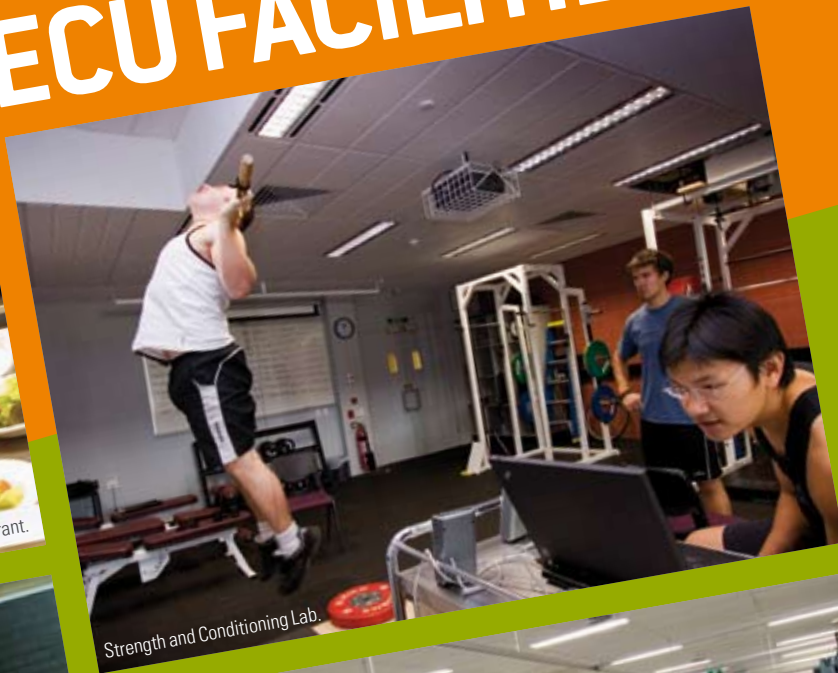
Strength and Conditioning Lab.