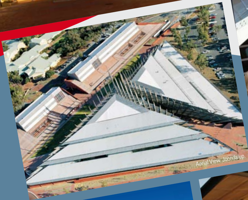
Aerial View, Joondalup.