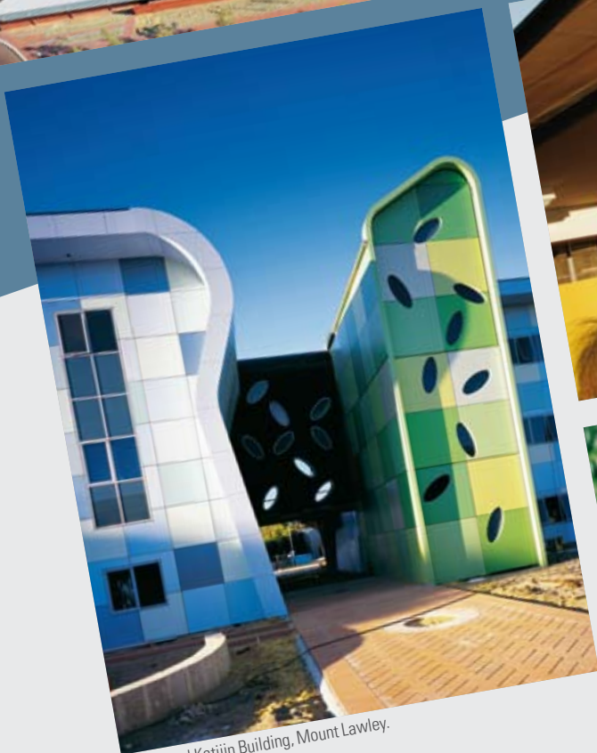
Kurongkurl Katijin Building, Mount Lawley.