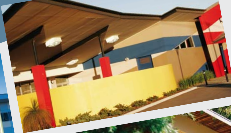
Education Building, Mount Lawley.